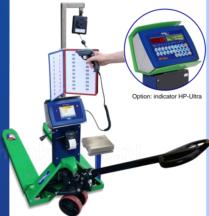
Option: indicator HP-Ultra