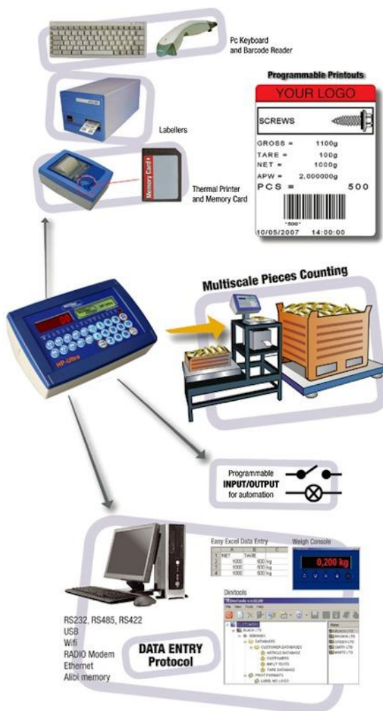
Schedule Counting of quantities